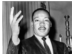
Image of Dr. King is cropped from the original.